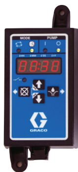
Harrier LT and Harrier